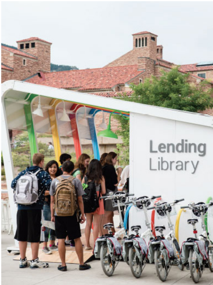
Folding bikes were parked at colorful bike racks and used by student crews to bike around campus and spread word of the "Lending Library."

A sleek pop-up "Lending Library" featured Chromebook colors and eye-catching brand messaging. There, students could demo the Chromebooks or—in a unique twist—borrow the devices for up to four days. The trial came with a pamphlet introducing key features and a $10 Google Play Card.