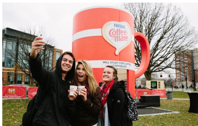
Social played a vital role in the success of the Coffee-mate on-campus event.

In addition to a cup of Joe, students visiting "The Café" were offered chair massages, could warm up by portable heaters, play games, listen to music or use the charging stations. The Café, produced by