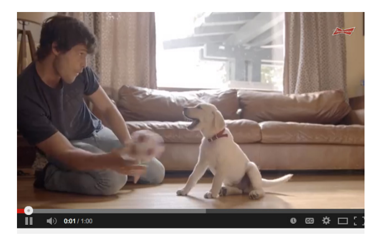
An adorable puppy helped this Budweiser responsible drinking video go wildly viral.

Tris3ct did just that for its client Northwestern Mutual.The insurance company signed its first major sponsorship, presenting sponsor of the Playoff Semifinal